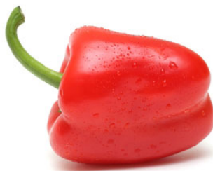
SWEET BELL PEPPERS