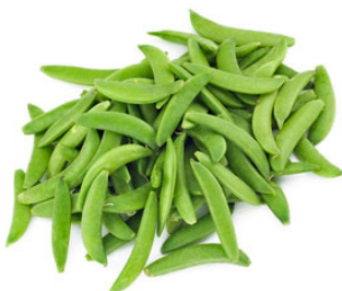
SWEET PEAS - FROZEN