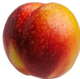
NECTARINES – IMPORTED